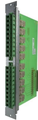
Fig. 1 B3-REL10

The B3-REL10 board contains 10 bistable 230 V / 3 A relays.